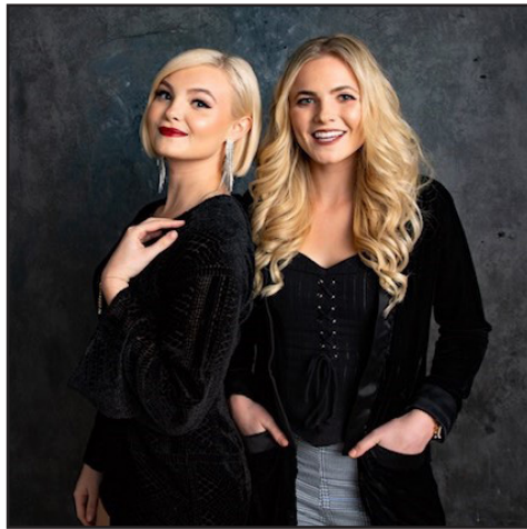
Tigirlily will perform for the North Dakota statewide virtual graduation May 30.

The ceremony will take place on May 30 at 2:00 p.m. Central Time (1:00 p.m. Mountain). It will be broadcast on ABC affiliates in North Dakota, and a livestream will be available on the websites of Forum Communications properties: InForum , Grand Forks Herald , Jamestown Sun and Dickinson Press . The livestream will be available for free and will not be behind the company’s paywall.