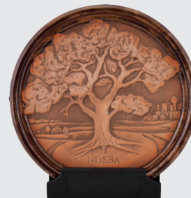
Legacy of Service Award