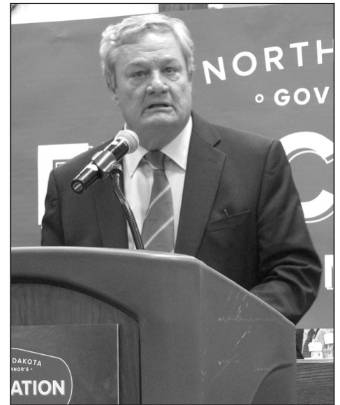
Governor Jack Dalrymple

“School districts are the epicenters of culture and community of every town. Foster friendly relationships and quality educational experiences in your schools and your town will maintain its quality North Dakota way of life.”